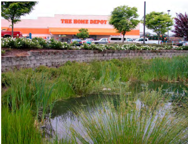
Home Depot, Glenn Widing Drive, North Portland