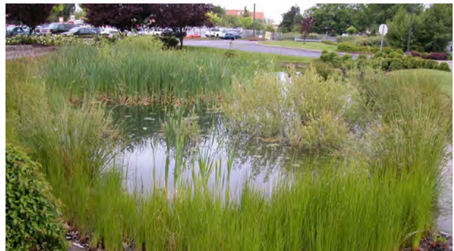
Home Depot, Glenn Widing Drive, North Portland

Extended dry basins may help fulfill a site's landscaping area requirement. This type of water quality facility is approved to treat stormwater from all types of impervious surfaces, including private property and the public right-of-way, rooftops, parking lots and streets.