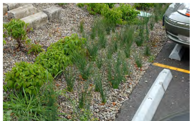
Oregon Zoo parking lot, Portland

Vegetated filter strips should be integrated into the overall site design and may help fulfill a site's landscaping area requirement. Vegetated filter strips can be used to manage stormwater runoff from a variety of impervious surfaces such as walkways and driveways on private property and within the public right-of-way. Check with the local jurisdiction if proposing to use a vegetated filter strip in the public right-of-way.