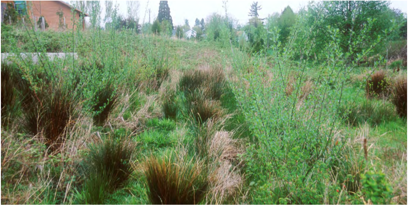
Arata Creek School, Troutdale