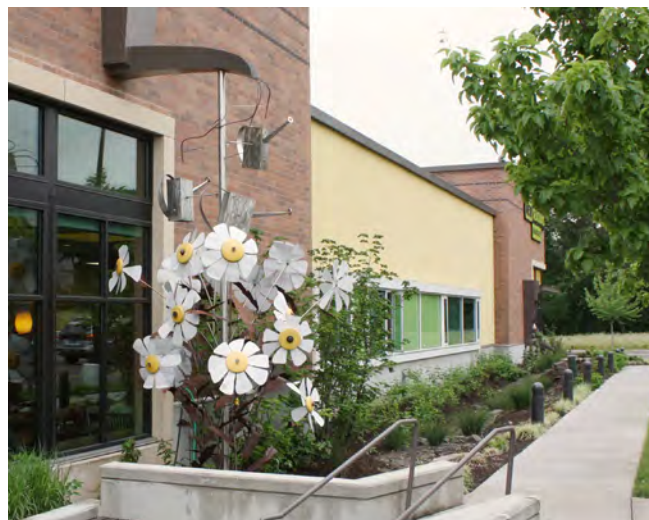
New Seasons, Beaverton. Two decorative scuppers collect and convey roof stormwater into an infiltration basin.