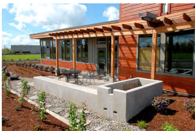
Team Estrogen Warehouse, Washington County. Stormwater from the warehouse roof is conveyed by a scupper into a concrete splash basin. The velocity of the water is slowed before the water flows into a vegetated swale.