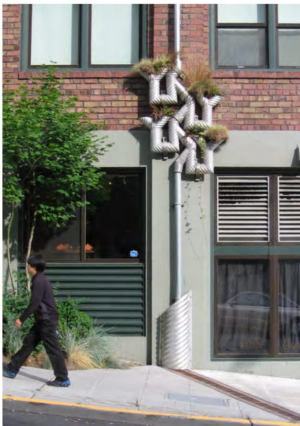
"Downspout 101", Seattle (artist Buster Simpson). The branching downspout is part of a public art project called "Growing Vine Street" that uses visual and provocative conveyance techniques to raise awareness of the stormwater flowing through the neighborhood.