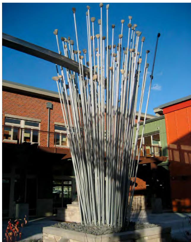
Block 11, Washougal, WA. Stormwater from surrounding rooftops is directed into the plaza's vertical sculpture before entering flow-through planters.