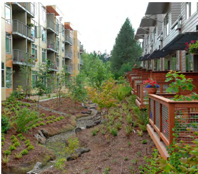
Headwaters at Tryon Creek, SW Portland. Headwaters is a residential development where senior housing, town homes, and an apartment building were designed to be integrated with the daylighting (removal from an underground piping system) of a tributary of Tryon Creek.