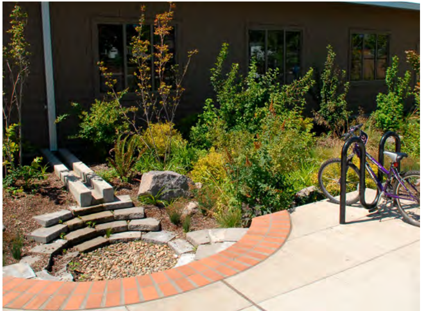
Estacada Library. Stormwater is conveyed from the rooftop to an infiltration basin. As the basin fills with water, it overflows into a connected series of swales and additional infiltration basins that convey stormwater around the library.