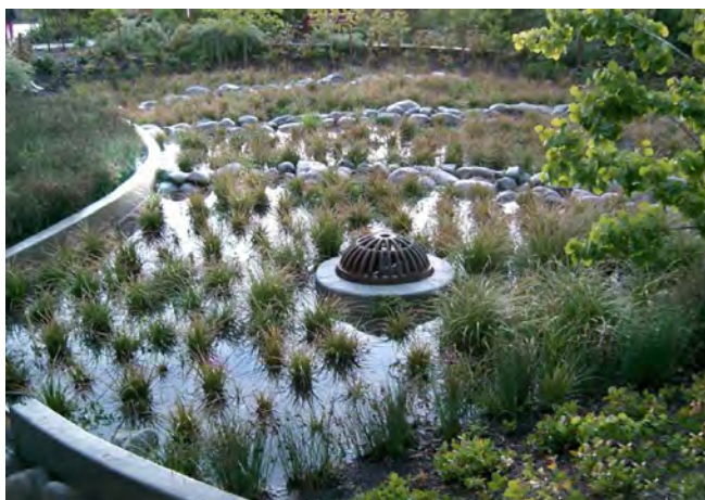
Glencoe Elementary School Rain Garden, Portland. Stormwater from neighboring streets is conveyed into an infiltration rain garden filled with native plants and rock berms that slow the flow of water. The rain garden is also a visual amenity and educational component for the elementary school.