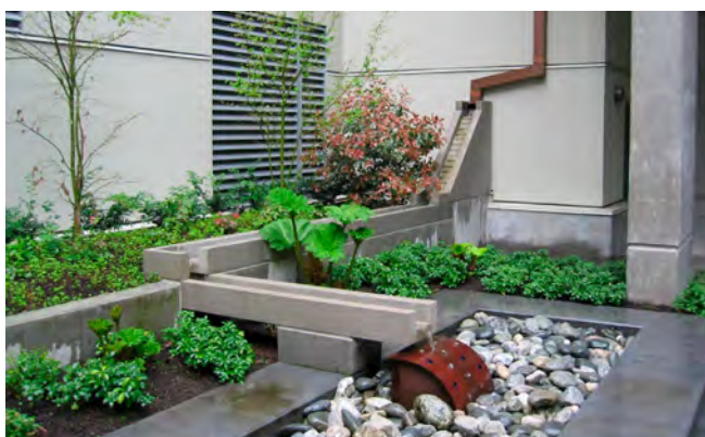
10th @ Hoyt, Portland. The design of this urban courtyard is inspired by Persian gardens. Downspouts convey stormwater from the surrounding rooftops into a series of channels and colorful fountains.