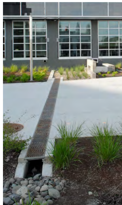
RiverEast Center, Portland. Stormwater from the rooftop is conveyed by a downspout into a sculptural basin made with reclaimed concrete from the retrofit of the building. The basin detains and slows runoff before it flows into a series of adjacent rain gardens, grated runnels and swales.