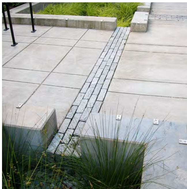
PSU Stephen Epler Hall. Stormwater from the impermeable plaza area is directed to bands of granite stone that are strategically placed at low drainage points to convey stormwater to a series of flow-through planters.