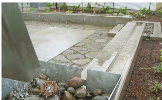
Local 49, Portland. Stormwater is conveyed from the rooftop by a decorative stainless steel metal scupper into the courtyard. Water flows from the scupper into a concrete runnel, detention basin and planters.