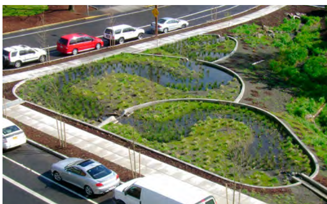
Headwaters at Tryon Creek, SW Portland. The rounded and stepped design of these infiltration planters are molded to the specific conditions of the site. The concrete walls are a creative interpretation of check dams that are used to convey water across flat surfaces over steep topography.