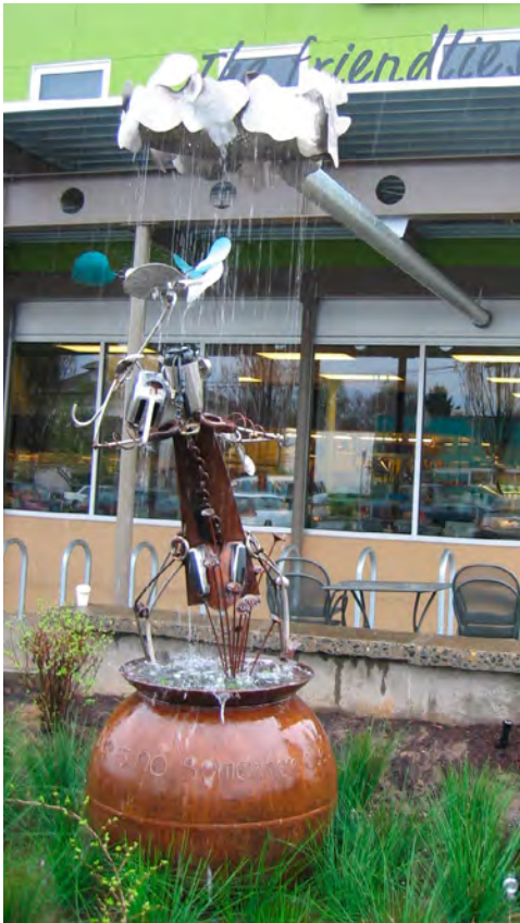
New Seasons, 20th and Division, Portland. A whimsical steel sculpture conveys stormwater from a grocery store rooftop into an infiltration planter.