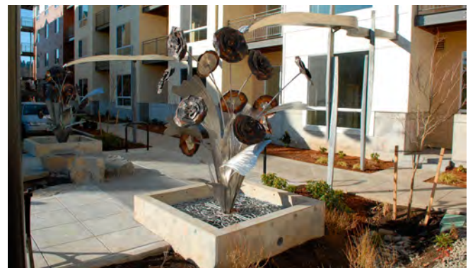
North Main Village, Milwaukie. Stormwater is the featured design element for this residential courtyard. Water from rooftops is conveyed by steel scuppers into decorative planters to meandering runnels and water quality swales.