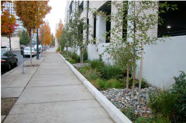
Rose Quarter parking structure, NE Portland