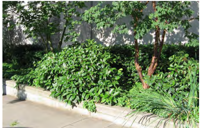
Buckman Terrace Apartments, Portland