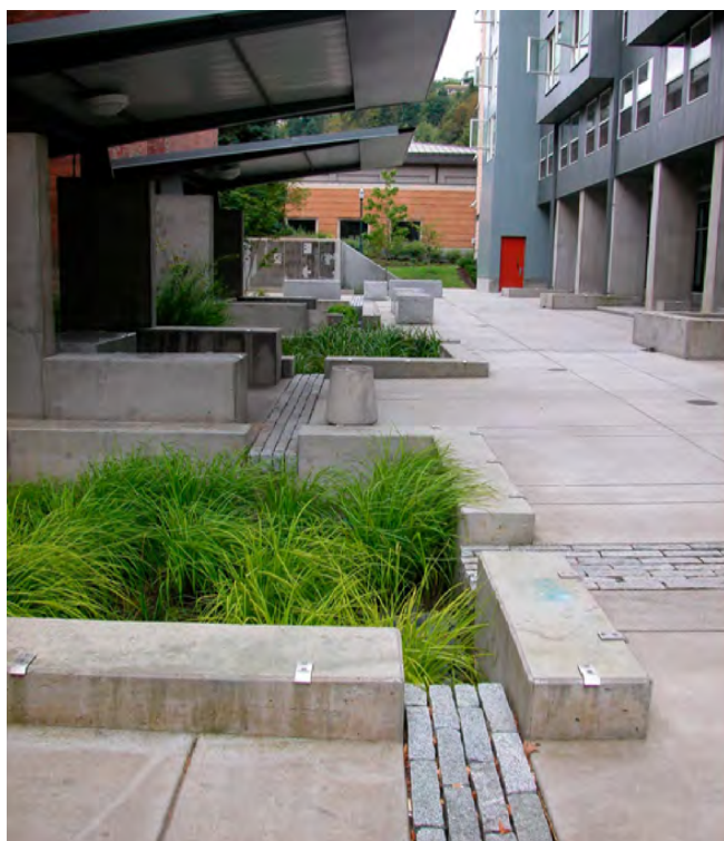
PSU Stephen Epler Hall, Portland