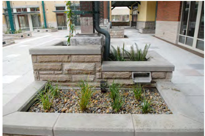
Washougal Town Square