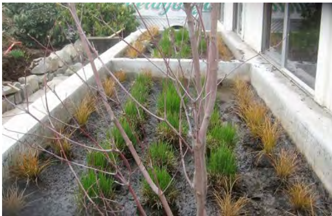
Aloha Dog and Cat Clinic, Washington County