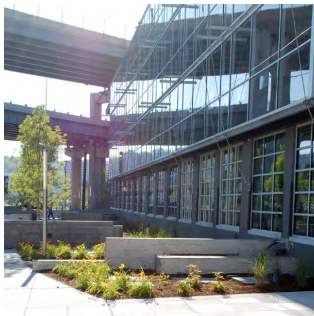
RiverEast Center, SE Portland