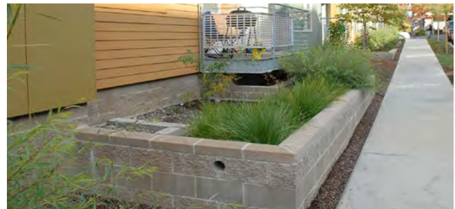
Headwaters at Tryon Creek, Portland

Flow-through planters may help fulfill a site’s landscaping area requirement and can be used to manage stormwater runoff from all types of impervious surfaces on private property and within the public right-of-way. Check with the local jurisdiction if proposing to use a flow-through planter in the public right-of-way. Flow-through planters can be placed next to buildings and are ideal for sites with poorly draining soils, steep slopes or other constraints. Design variations of shape, wall treatment and planting scheme will fit the character of any site.